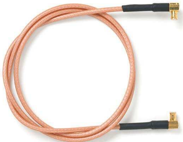
Model 73068 MCX Right-Angle Plug to MCX Right-Angle Plug, RG316/U

Snap-on coupling and miniature size for fast connect and disconnect where space is limited